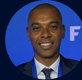
FERNANDO LUIZ ROSA, "FERNANDINHO" PROFESSIONAL FOOTBALL PLAYER