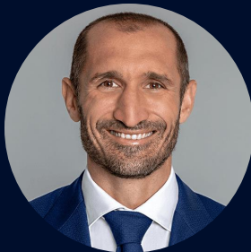
GIORGIO CHIellini FORMER PROFESSIONAL FOOTBALL PLAYER and CURRENT HEAD OF FOOTBALL INSTITUTIONAL RELATIONS AT JUVENTUS FC