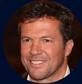
LOTHAR MATTHÄUS FORMER PROFESSIONAL FOOTBALL PLAYER and FIFA Legend