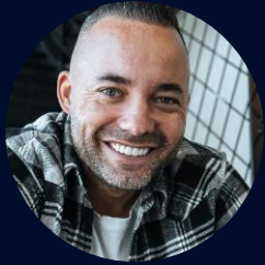
DEMY DE ZEEUW

Demy (Netherlands) is a former professional footballer who played for several European clubs and the Netherlands national team, including at the 2010 FIFA World Cup™.