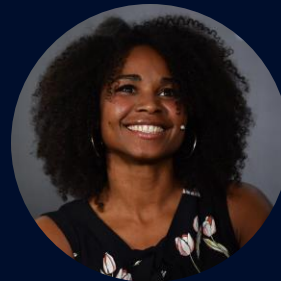
LAURA GEORGES FORMER PROFESSIONAL FOOTBALL PLAYER and FORMER GENERAL SECRETARY OF THE FRENCH FOOTBALL ASSOCIATION