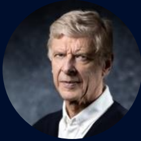
ARSÈNE WENGER FIFA CHIEF OF GLOBAL FOOTBALL DEVELOPMENT